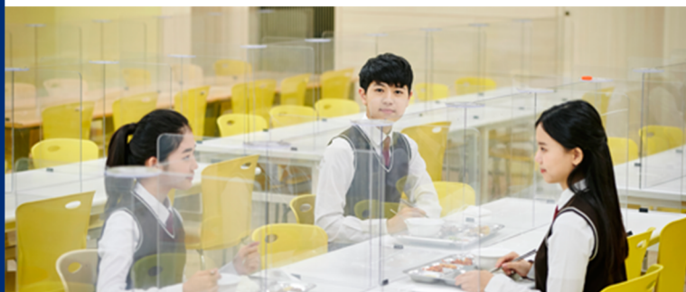
Large Scale Cafeteria